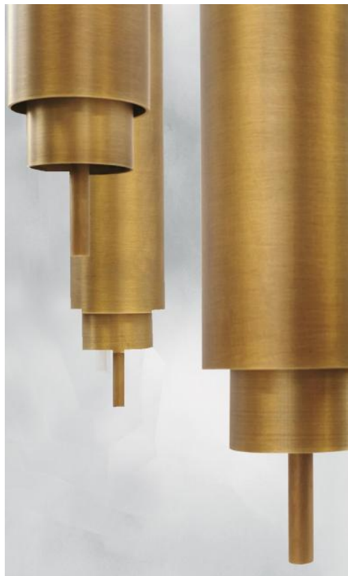
TOKYO 3 ø20 in light bronze. Metal finish code: 28