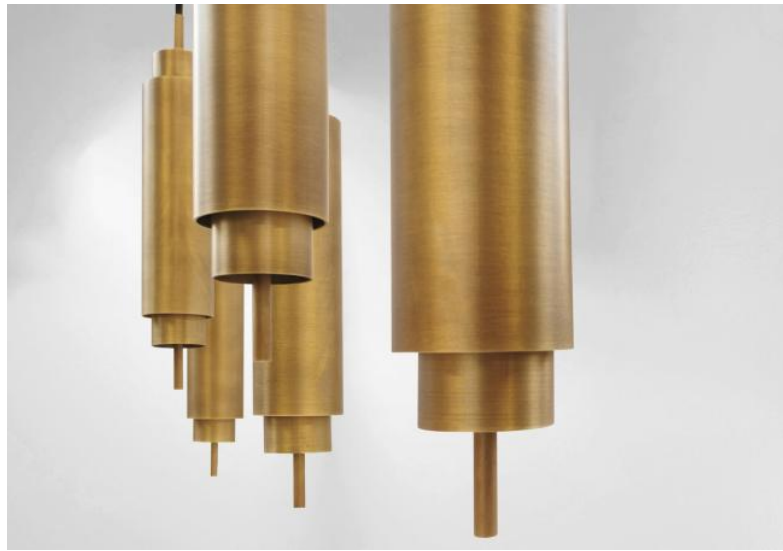
TOKYO 5 # in light bronze. Metal finish code: 28