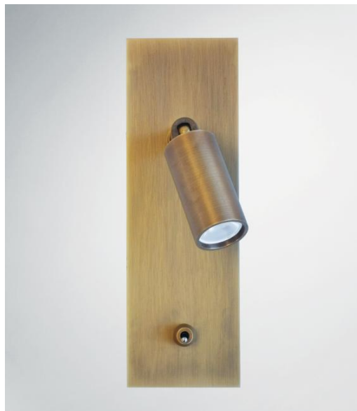
TINOS in light bronze. Metal finish code: 28