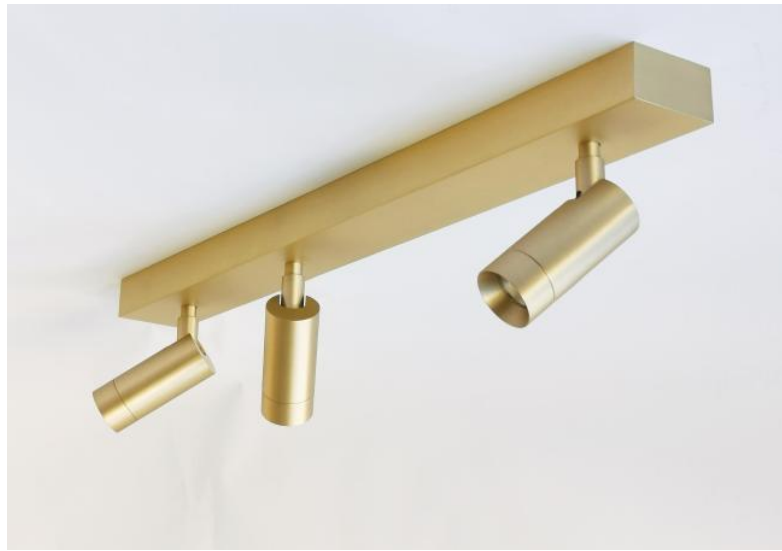
ALTA 2+1 in brushed brass. Metal finish code: 25