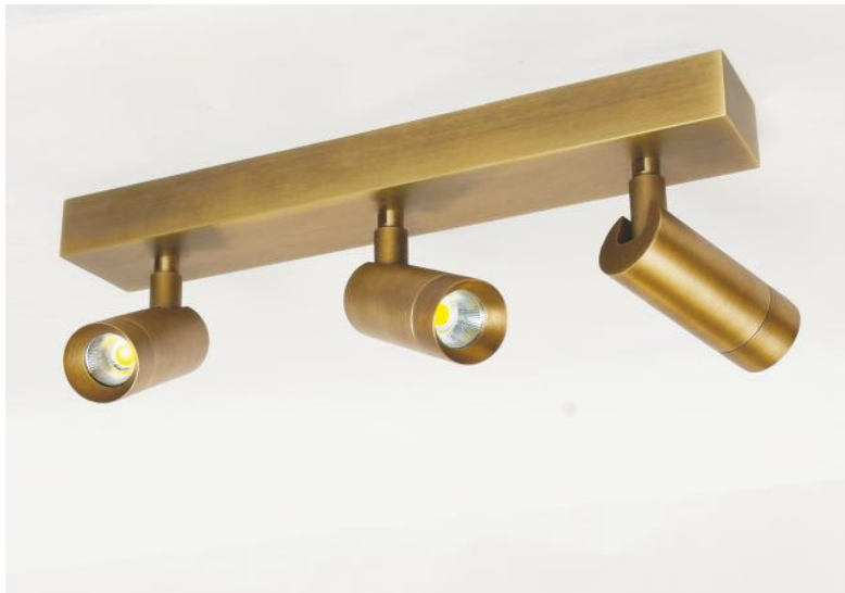
ALTA 3 in light bronze. Metal finish code: 28