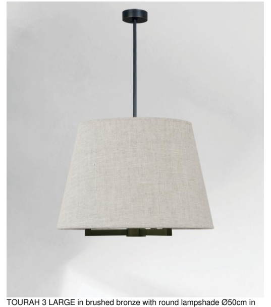
Lin Moscou (fabric from category 2)