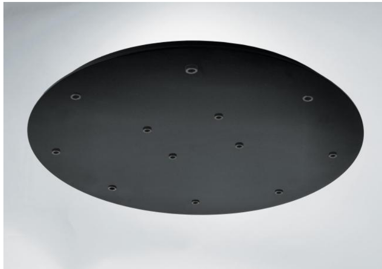
CEILING BASE 12 o58 in structured black. Metal finish code: 02. Optional: a wide choice of cables and fittings (+supplement)