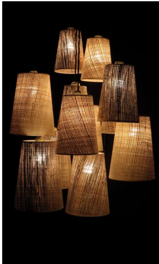
SIMBA 12 o58 in structured black/brushed brass with lampshades in Raphia nature and Raphia banane (fabrics from category 3)