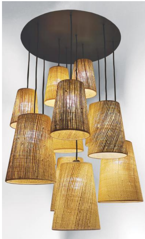
SIMBA 12 o58 in brushed bronze with lampshades in Raphia Nature and Raphia Banane (materials from category 3)