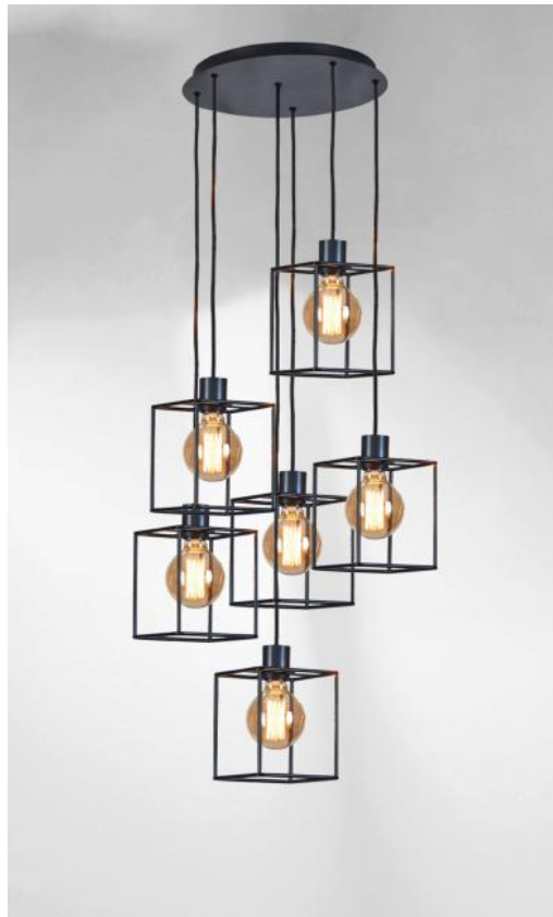
KERMA 6 o38 in brushed bronze with structures in black epoxy