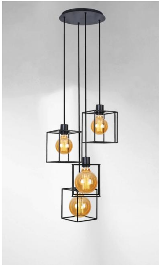
KERMA 4 o26 in brushed bronze with structures in black epoxy