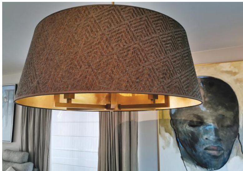
TOURAH 6 LARGE in light bronze and lampshade Ø90cm in Arrow Casamance (fabric from category 4) + gold leaf inside