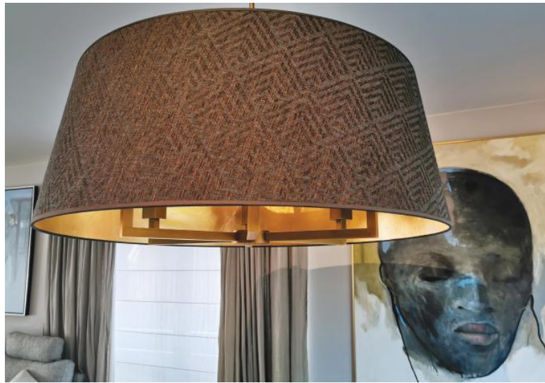
TOURAH 6 LARGE in light bronze and lampshade Ø90cm in Arrow Casamance (fabric from category 4) + gold leaf inside