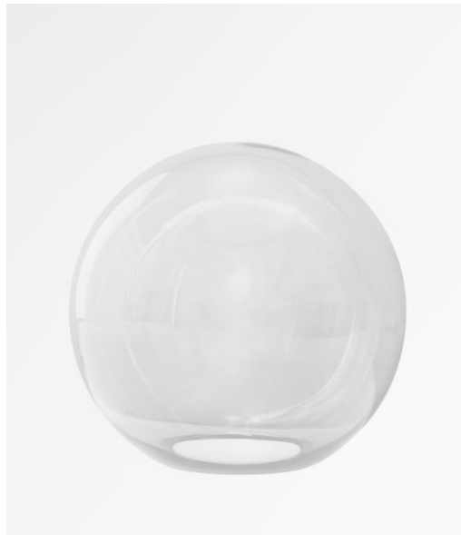
SPHERE LARGE glass Ø30cm transparent (code 80)