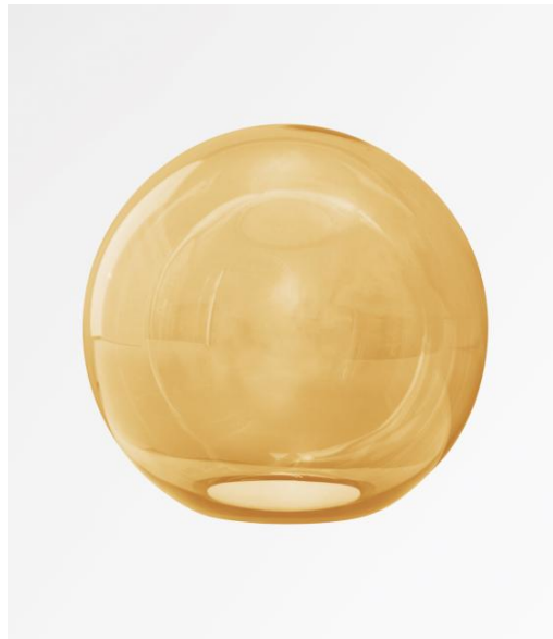
SPHERE MEDIUM glass Ø25cm amber (code 85)