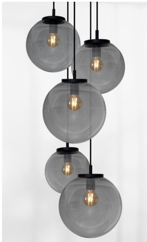
FORYOU 5 o33 in structured black (code 02) with anthracite glasses (code 82)