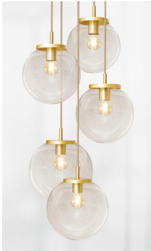
FORYOU 5 o26 in brushed brass (code 25) with transparent glasses (code 80)