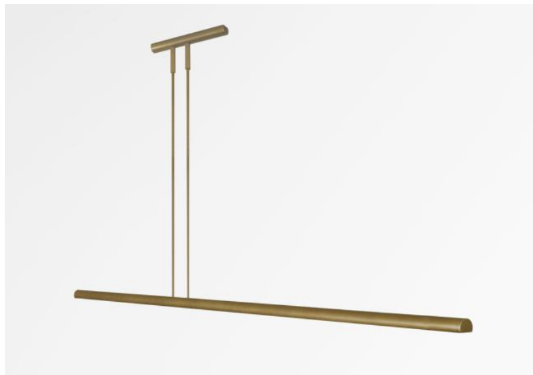
AXELL 120 in light bronze