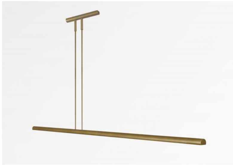
AXELL 120 in light bronze