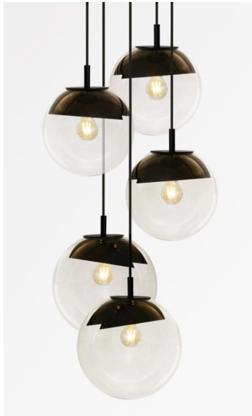
LUNA 5 o26 in structured black (code 02) with transparent glasses (code 80)