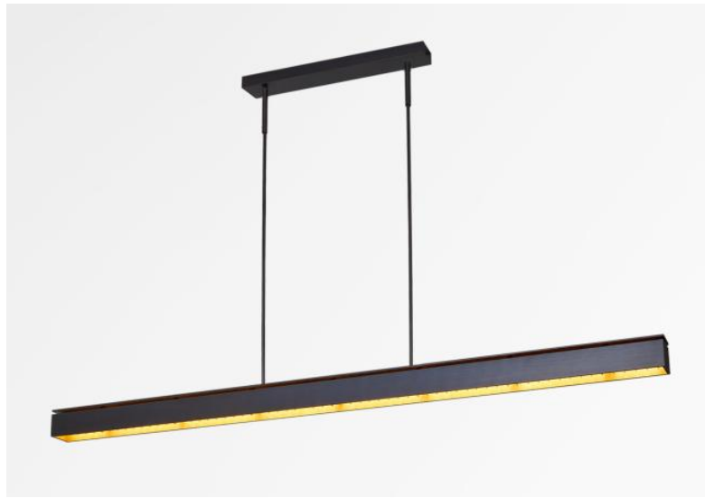
GALAND J tubes in brushed bronze. Metal finish code: 29