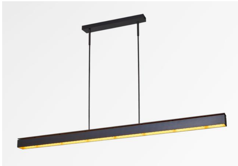
GALAND J tubes in brushed bronze. Metal finish code: 29