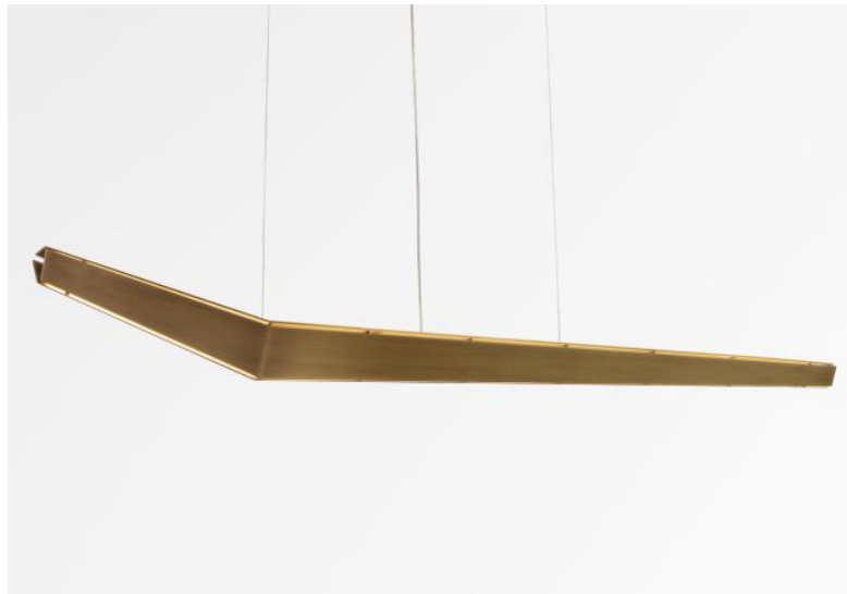
LUNGA ø in light bronze