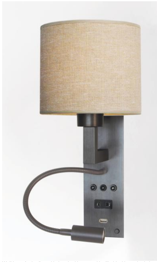
Wall lamp for bedboard in brushed bronze with cylindrical lampshade in Stone Calcite (fabric from category 4)