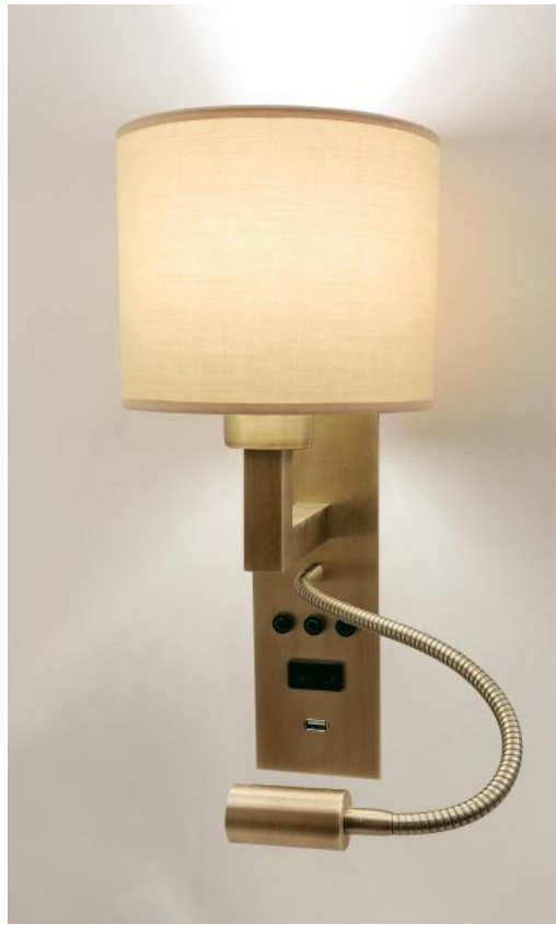
Wall lamp for bedboard in light bronze with cylindrical lampshade in Coton Pirée (fabric from category 1)