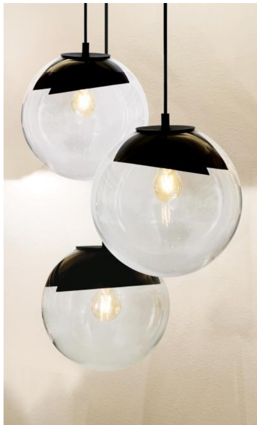
LUNA 3o26 structured black (code 02) with transparent glasses (code 80)