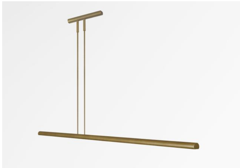
AXELL 90 in light bronze