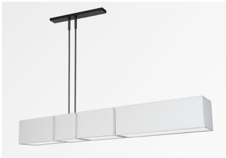
WRIGHT in brushed bronze with lampshades in Madison naturel (fabric from category 2)