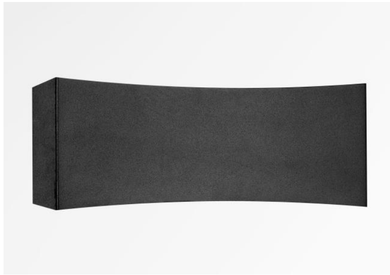
PHOBOS in structured black