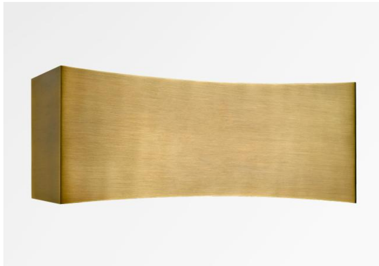
PHOBOS in light bronze. Metal finish code: 28