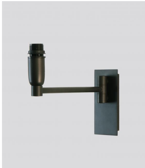
SOKARIS -SW in brushed bronze without lampshade