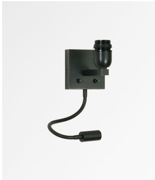
TEOS without lampshade in brushed bronze. Metal finish code: 29