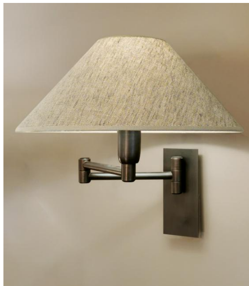
AHMOSIS -SW in brushed bronze with lampshade in Stone Calcite (fabric from category 4)