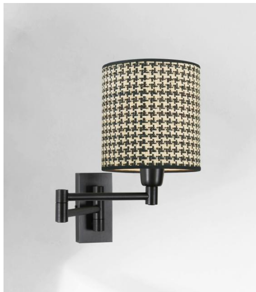
MAMMISI -SW in brushed bronze with lampshade Palmier Pied de Poule (material from category 5)