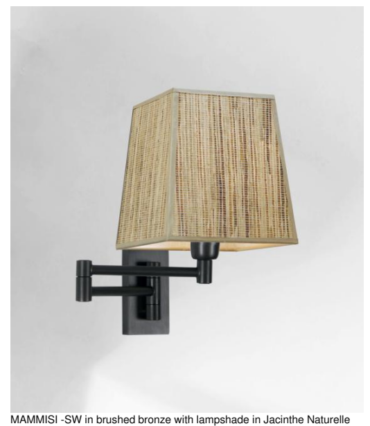
(material from category 5)