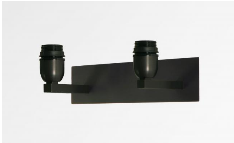
MONTOU in brushed bronze without lampshades