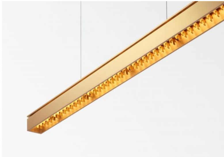
GALAND J ø in matt brass