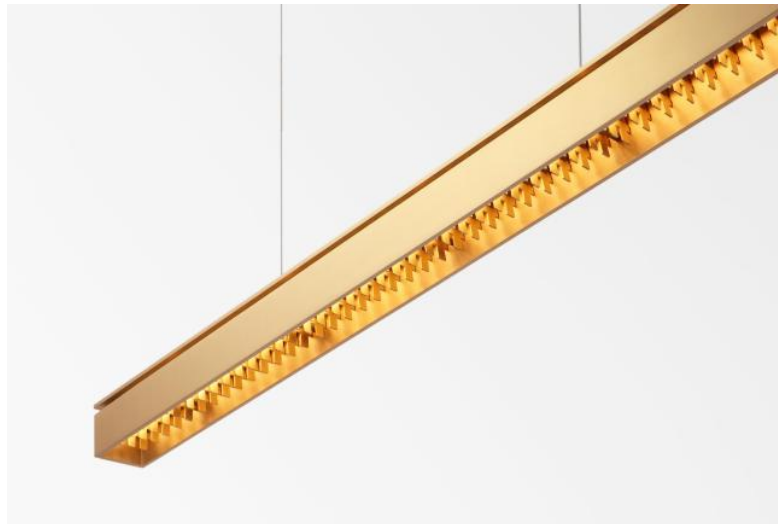
GALAND J ø in brushed brass. Metal finish code: 25