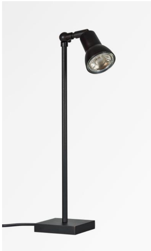
VENATOR 1 in brushed bronze