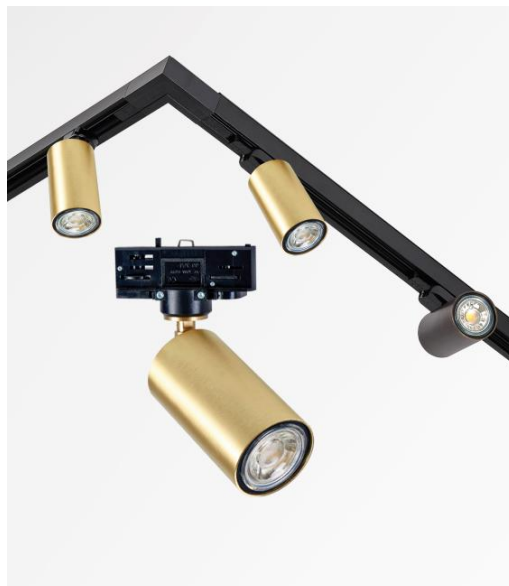
DEIMOS RAIL + SPOTLIGHTS on rail in brushed brass and in brushed bronze. Metal finishes codes: 25 & 29