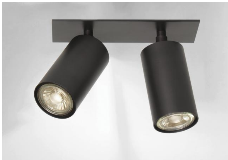
DEIMOS P2 # in brushed bronze. Metal finish code: 29