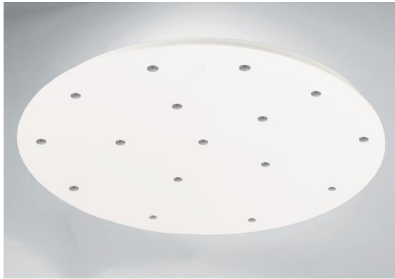
CEILING BASE 16 o83 in structured white. Metal finish code: 01. Optional: a wide choice of cables and fittings (+supplement)