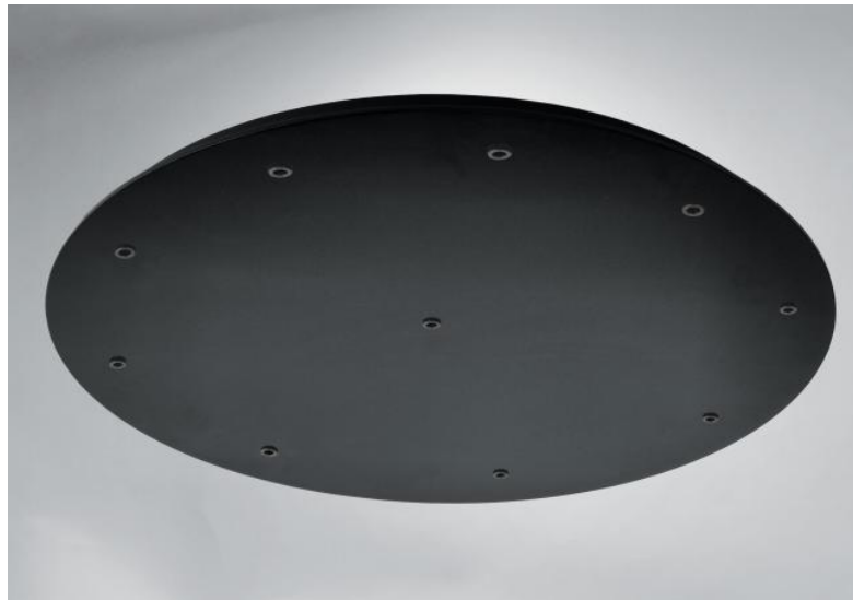
CEILING BASE 10 o83 in structured black. Metal finish code: 02. Optional: a wide choice of cables and fittings (+supplement)