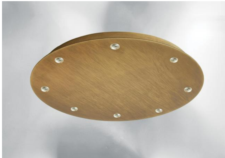
CEILING BASE 8 o30 in light bronze. Metal finish code: 28. Optional: a wide choice of cables and fittings (+supplement)