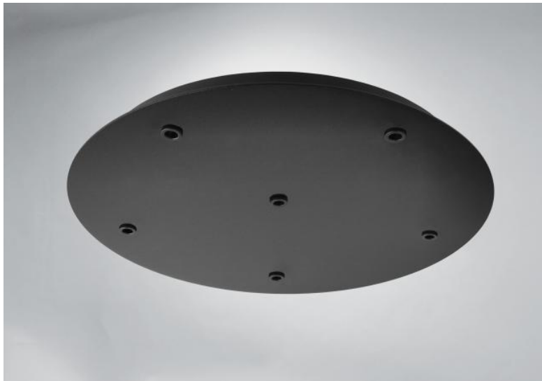
CEILING BASE 6 o38 in structured black. Metal finish code: 02. Optional: a wide choice of cables and fittings (+supplement)