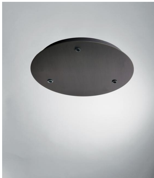
CEILING BASE 3 o20 in brushed bronze. Metal finish code: 29. Optional: a wide choice of cables and fittings (+ supplement)