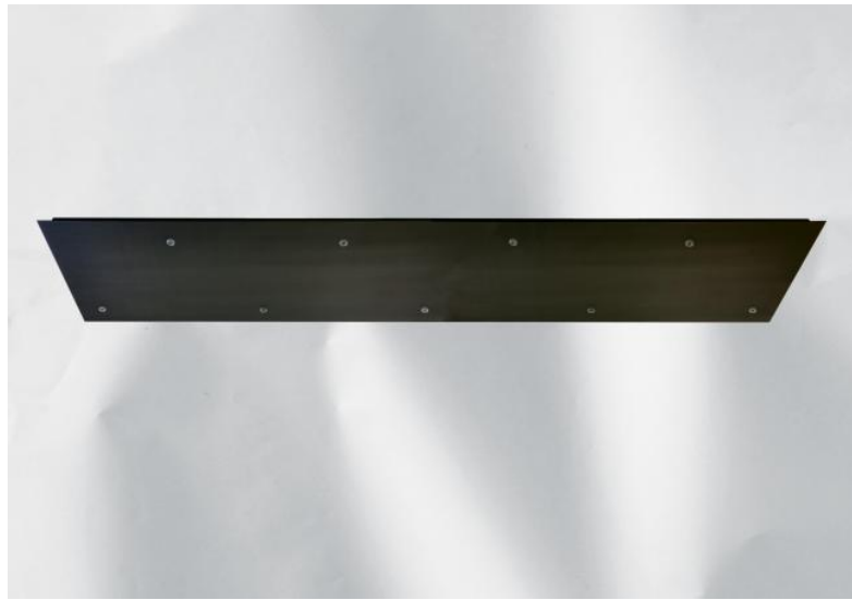
CEILING BASE 9 # in brushed bronze. Metal finish code: 29. Optional: a wide choice of cables and fittings (+supplement)