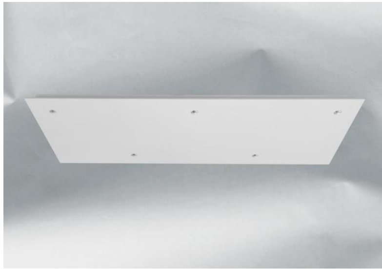
CEILING BASE 5 # in structured white. Metal finish code: 01. Optional: a wide choice of cables and fittings (+supplement)