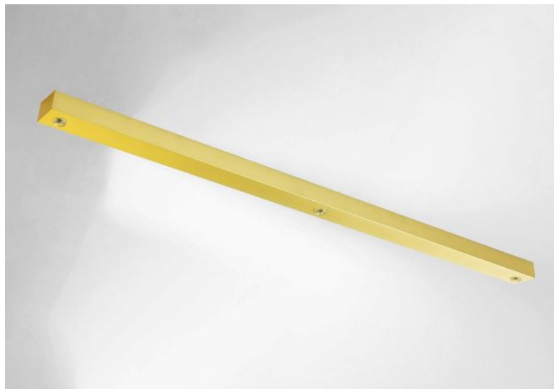
CEILING BASE L 3 in brushed brass. Metal finish code: 25. Optional: a wide choice of cables and fittings (+supplement)