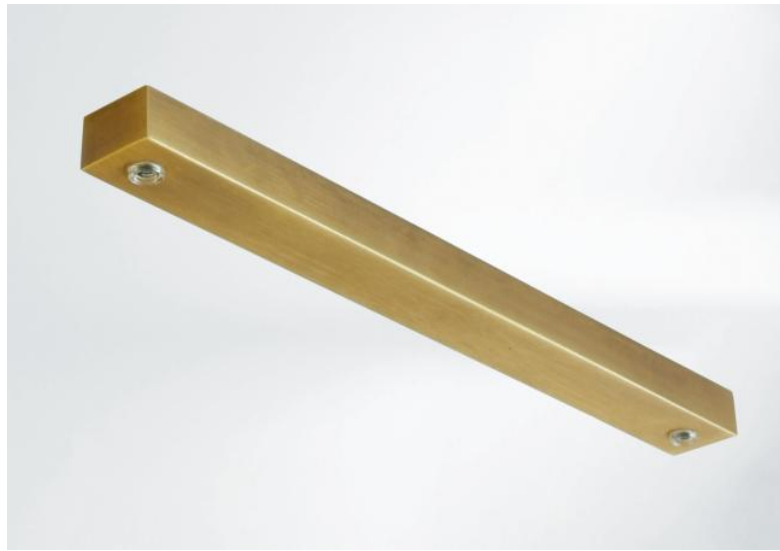
CEILING BASE L 2 in light bronze (option). Metal finish code: 28. Optional: a wide choice of cables and fittings (+supplement)