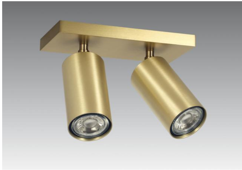
DEIMOS S2 # in brushed brass (code 25)