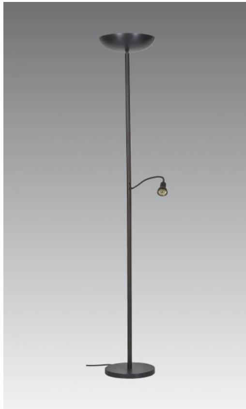
CELIA in brushed bronze