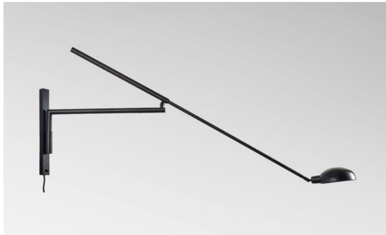
POLLUX + SW in brushed bronze