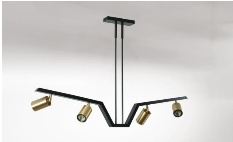
ALBATROS in brushed bronze and brushed brass (code 95)