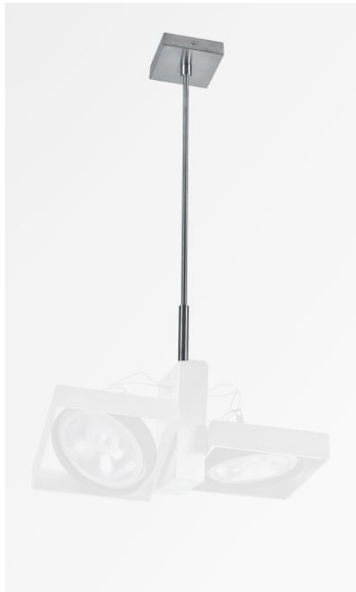
SARGAS 2 mounted on a SARGAS 2 SUSPENSION