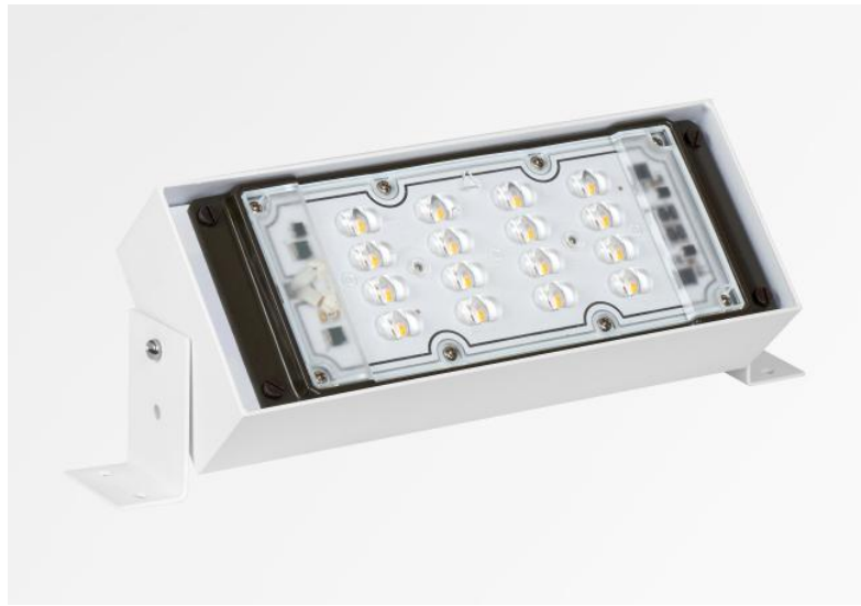
UP 300 in structured white