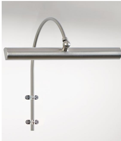
TRIANON 25 in brushed nickel. Metal finish code: 33