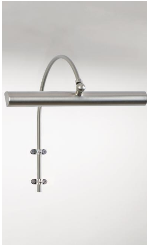
TRIANON 25 in brushed nickel. Metal finish code: 33